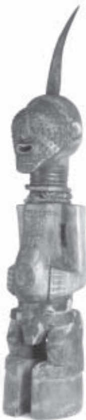
Songye People Female Figure (Nkisi) . Wood, metal. UIMA, The Stanley Collection.

The University of Iowa Museum of Art possesses the vision and boldness to see what is possible not just for the future of art, but also for its own future on the University of Iowa campus and in the extended community. To that end, the Museum has key goals and needs. Should you choose to help us achieve these goals, the Museum will ensure that you receive appropriate thanks and recognition for your generosity. (Please see page 5 for contributor recognition opportunities.)