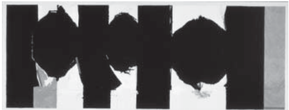
Robert Motherwell, Elegy to the Spanish Republic No. 126 , 1965-1975. Acrylic on canvas.

Web: http://www.uifoundation.org/art_museum/