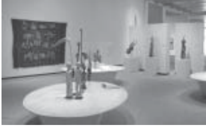
African collection in the museum's south gallery