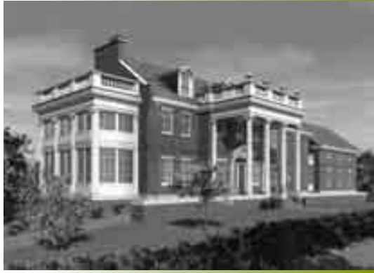
Architect's rendering of restoration of 102 Church Street

• Pearson Educational Measurement of Iowa City has given $250,000 to support construction of the new Pomerantz Center, a comprehensive facility that will provide academic, career, and recruiting resources for prospective and current students and alumni. In recognition of the gift, the center's career-services library will be named the Pearson Career Services Library.